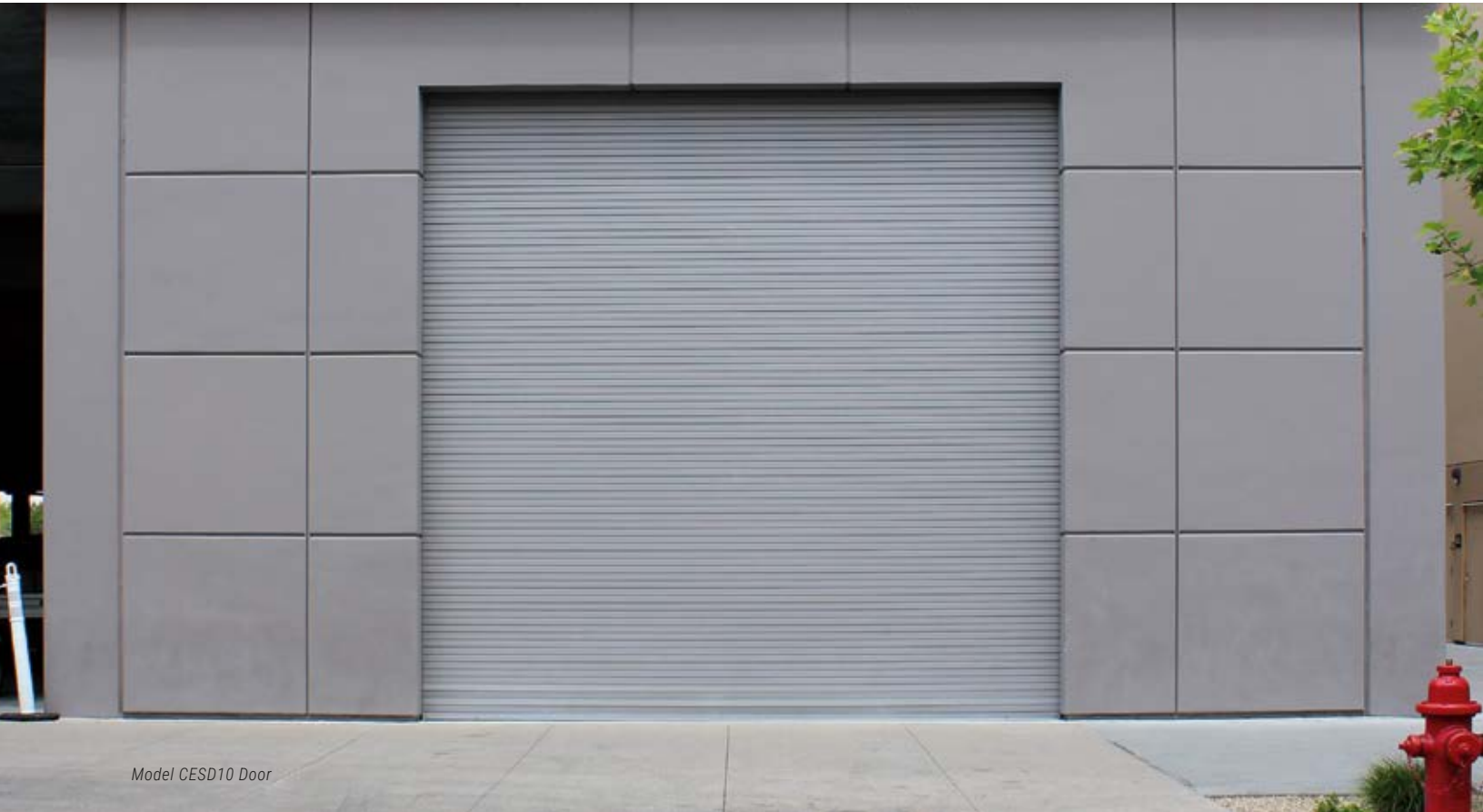
Model CESD10 Door