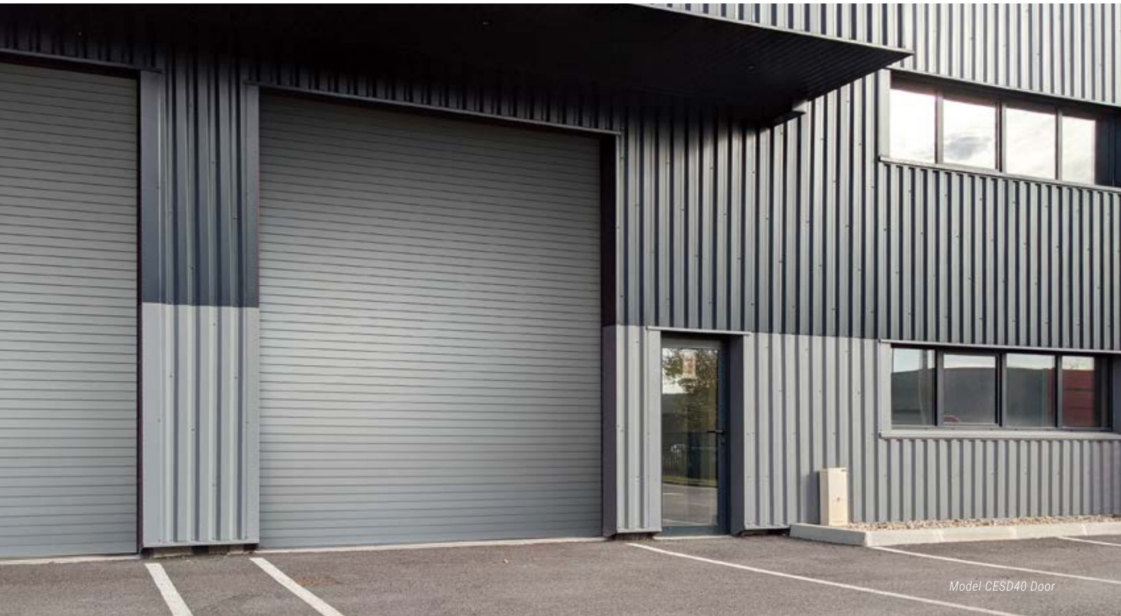
Model CESD40 Door